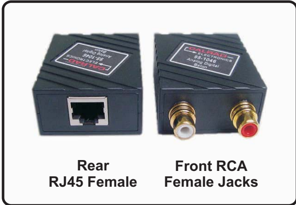
Rear RJ45 Female

This RCA Audio \ Video Balun is ideal for corporate A/V, schools, home theater and any other situation involving structured audio distribution that transmits Video, dual mono, single stereo or digital audio signals via Cat.5/6 UTP cable. This Balun provides a low cost and versatile cabling solution for any audio distribution system.