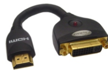
Optional 35-716 HDMI Male to DVI Female Adapter