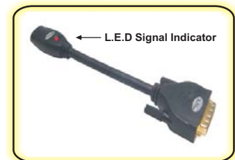
Calrad 35-715 6" adapter cable DVI-D Male to HDMI Female Adapter