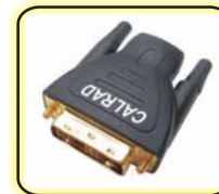
Calrad 35-711 HDMI Female to DVI-D Male Adapter