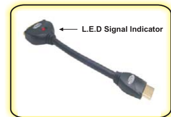
Calrad 35-716 6" adapter cable DVI-D Female to HDMI Male Adapter