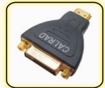
Calrad 35-712 HDMI Male to DVI-D Female Adapter