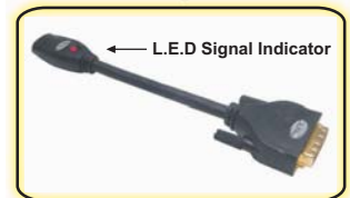
Calrad 35-715 6" adapter cable DVI-D Male to HDMI Female Adapter