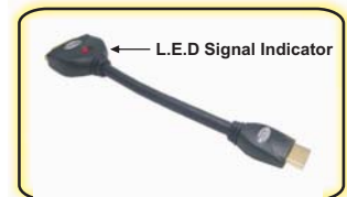
Calrad 35-716 6" adapter cable DVI-D Female to HDMI Male Adapter