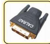
Calrad 35-711 HDMI Female to DVI-D Male Adapter