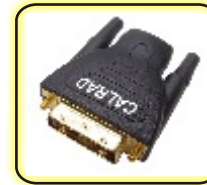
Calrad 35-711 HDMI Female to DVI-D Male Adapter