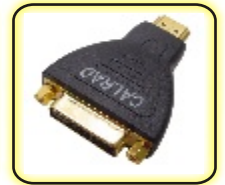
Calrad 35-712 HDMI Male to DVI-D Female Adapter