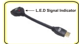
Calrad 35-716 6" adapter cable DVI-D Female to HDMI Male Adapter